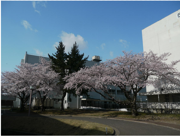
Fig. 1: A sample photo.

margins. Only the top page has 30mm top margin and 25mm side margins in the title to the abstract area. The main text should be written in double column with 8mm separation. The type of the paper is indicated on the top-left of the first page.